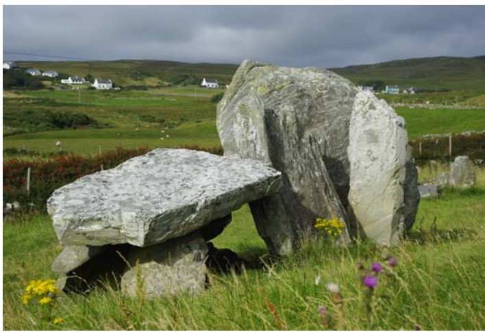
Fig. 2. Dolmen, Málainn Mhóir, Co. Donegal, Ireland

In practical Irish folk medicine the dolmens were used as a cure for childlessness: the person either had to spend a night or to initiate a conception beneath the dolmen.